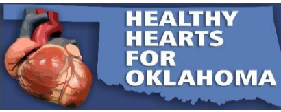
Chart Abstraction Instructions –Smoking Cessation and Intervention