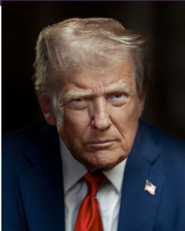
President Donald J. Trump