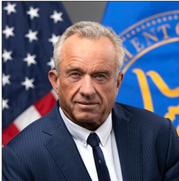
Secretary Robert F. Kennedy, Jr.